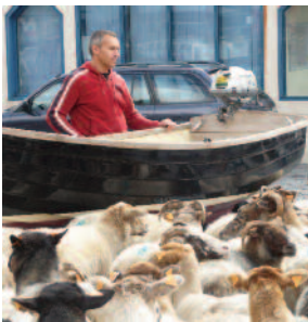
DENICOLAI & PROVOOST SMALL BOATS AND SHEEP DAY ± 100 X 350 CM. FRAMED PHOTOS, PRINT, FLATSCREEN TV 2013

The new project 'Small Boats and Sheep Day' shows two groups that come together. On a Thursday in September 2012, the artist duo created a performance on the market of Ghent. The two gatherings, boats and sheep, are a confusing and impossible combination. Only coincidental trespassers witnessed this intervention in public space. The action was done within the framework of the exhibition TRACK 2012 and is now presented, for the first time, in a unique triptych (panel with photos, layout drawing and a video).